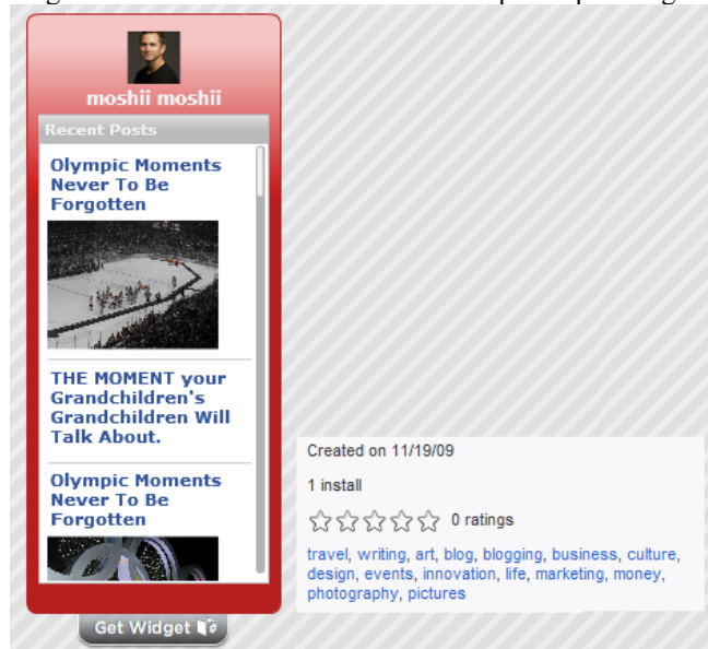
Fig. 1. An example of a widget with overflowing tags.