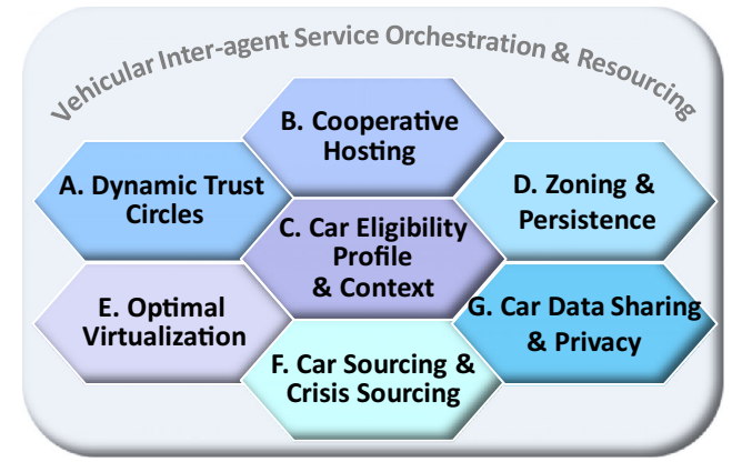
Fig. 3 ViSOR functions

Deployment of AVECs requires an orchestration system vehicular inter-agency service orchestration and resourcing (ViSOR), as in Fig. 3. ViSOR creates a temporary community,